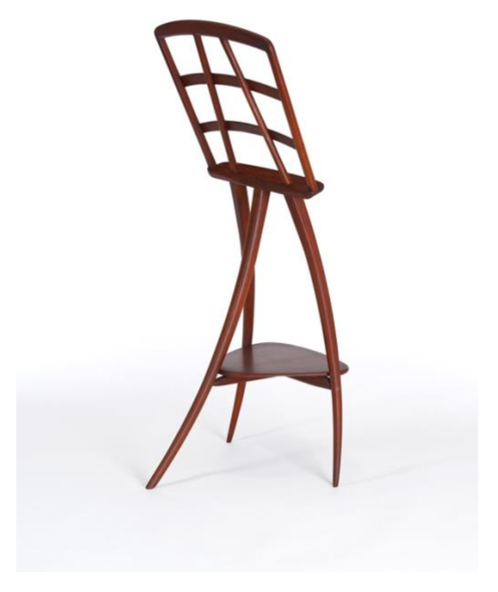
Single Music Stand, Wharton Esherick, 1960, cherry, walnut, 44 \times 18.25 \times 20 , from the Collection of the Wharton Esherick Museum, based on the prototype created for the Rubinsons.

Complimenting the display of Esherick's prototype music stand is a selection of archival materials and sketches. As important patrons whose friendship with Esherick lasted for three decades, the Rubinson's feature heavily among the stories