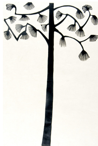
Alabama Pine (1929)