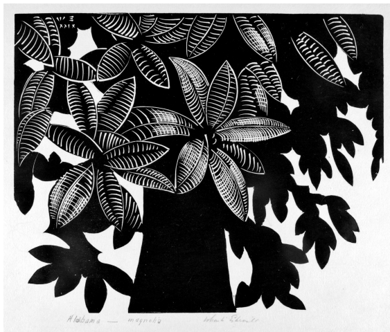
Alabama Magnolia (1929)