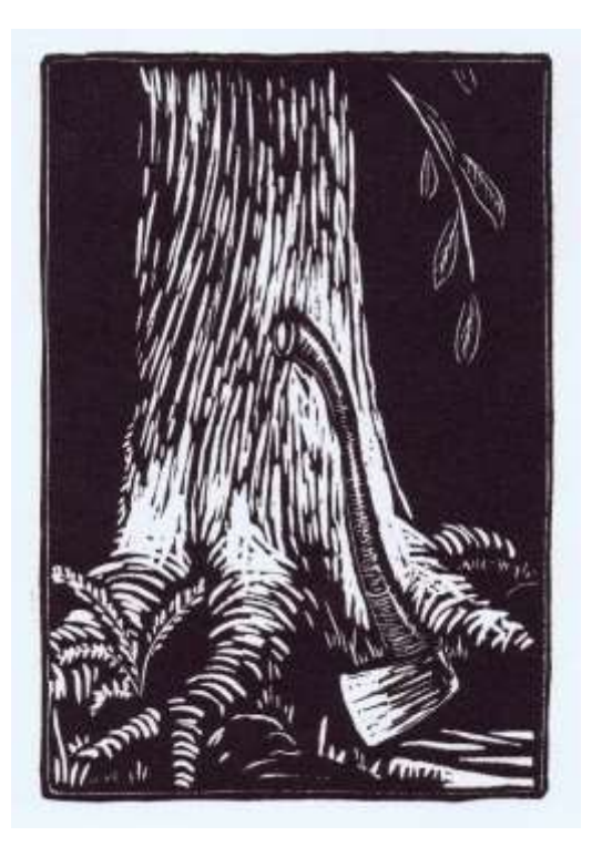
Frontspiece – Song of the Broad-Axe, woodcut, Wharton Esherick.

Exhibitions in our Visitor Center are free to the public. This does not include admission to the Museum for which advance reservations are required.